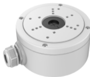
DS-1280ZJ-S Junction Box