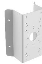
DS-1276ZJ-SUS Corner Mount