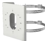
DS-1275ZJ-S-SUS Vertical Pole Mount